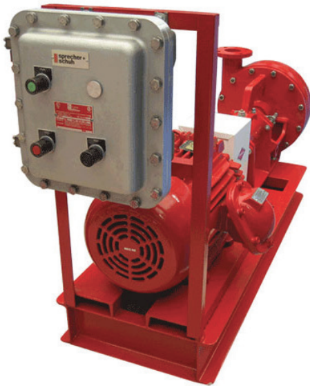
Explosion Proof motor control panel mounted directly to motor and pump frame.

Sprecher + Schuh offers explosion-proof starters for environments covered by the following classifications: