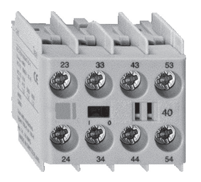
CS8 front mount auxiliaries are positive guidance

Despite increasing complexity, control systems and installations must become increasingly compact. And the CS8 Miniature Relay System packs maximum performance into minimum space.