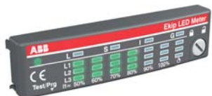
Ekip LED Meter