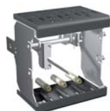
Conversion kit for turning a fixed circuit breaker into the moving part of a withdrawable circuit breaker