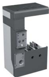
RC Inst / RC Sel