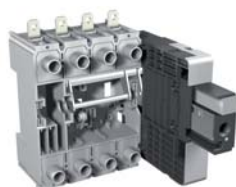
Fixed part of withdrawable