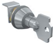
Key lock on the handle