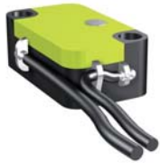
AUE - Early auxiliary contacts