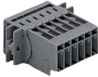
Socket plug connector