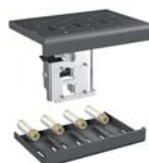
Conversion kit of the circuit breaker from fixed into moving part of plug-in