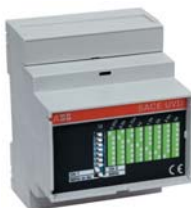
Time delay device for undervoltage release