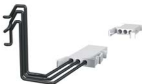
Fixed/Moving part connector for withdrawable