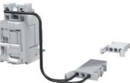
UVR for withdrawable