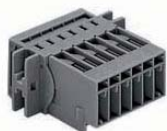
Socket-plug panel connector