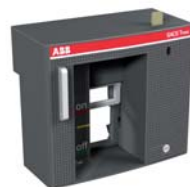
Front for operating lever mechanism