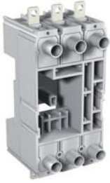
Fixed part of plug-in