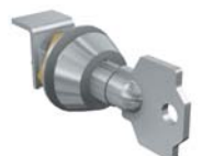
Key lock on the handle