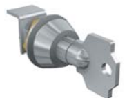
Key lock on the circuit breaker