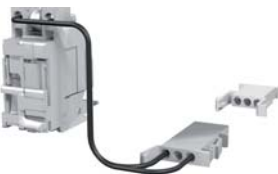
SOR for withdrawable