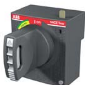
Direct rotary handle