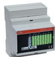
Time delay device for undervoltage release