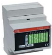
Time delay device for undervoltage release